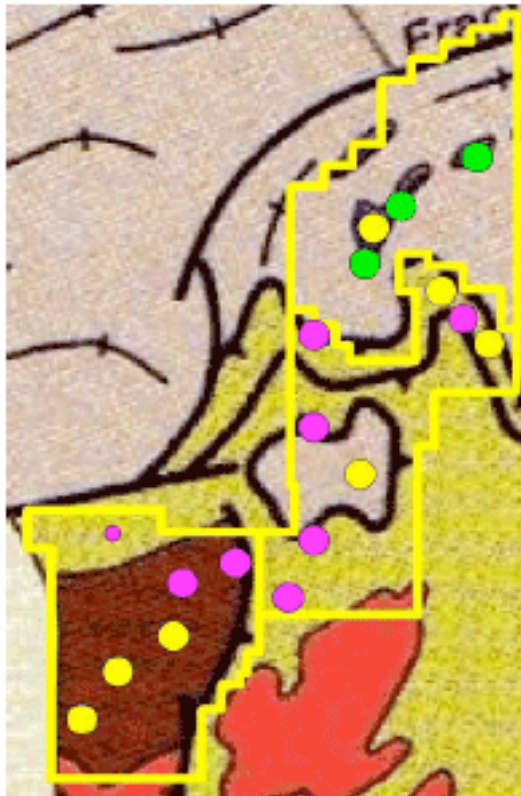
Target areas: Yellow=Gold, Pink=Manganese, Green=Iron